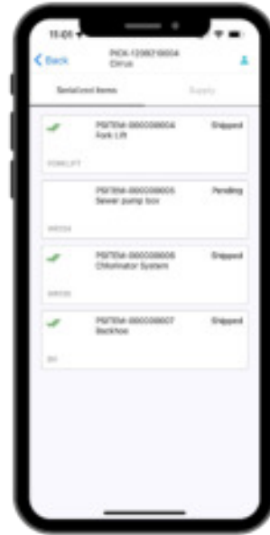
FX Rental Mobile View

Reporting- By collecting data in FieldFX and FX Rental, the data becomes centralized and actionable. Create reports such as: assets on location, profit margin, utilization, upcoming deliveries, returns, pending order, outstanding. Report by job, by region or even globally to run the business more strategically.