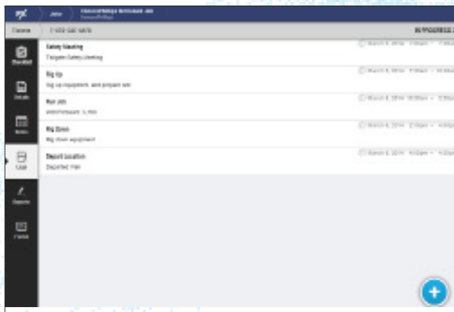
Mobile view of the ticket log in FieldFX